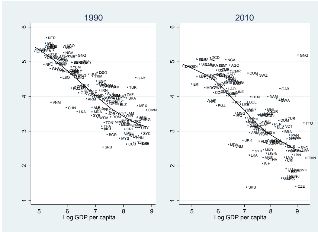
Figure 1. Relationship between Log (U5M) and Log (GDP per capita). The well-known Preston relationship is clearly visible, with a correlation coefficient of -0.79. A loess curve is added showing a similar slope for both years.